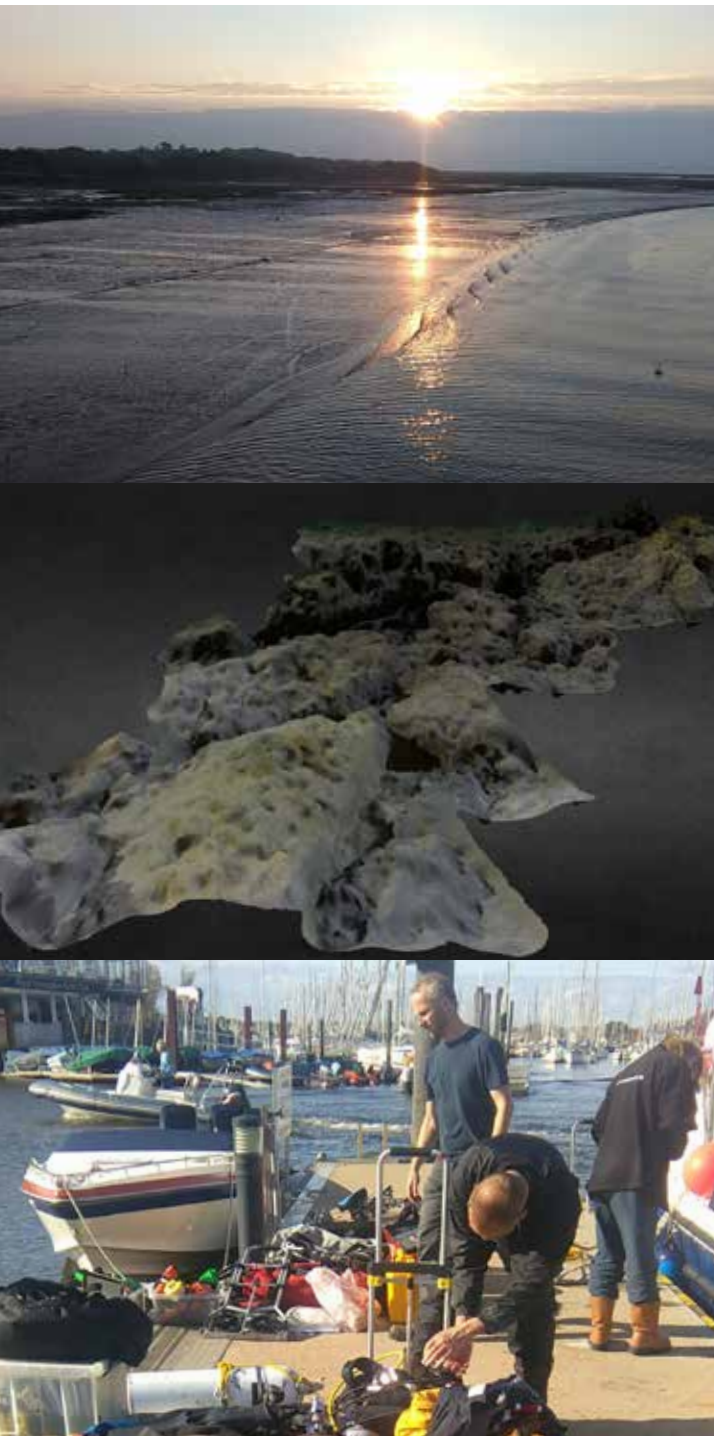
Images: This page. Top: The exposed mudflats of the western Solent at low tide cover a 6,000 year old landscape. Middle: An underwater 3D photographic image of eroding archaeological site at Bouldnor Cliff (see page 16 for more information). Bottom: Divers preparing to head into the Solent. Facing page: The Mesolithic Woodworking Project team during experimental work at Exbury Gardens.

The last decade has seen the discovery of many submerged landscapes in the North Sea and the Channel. This has been complemented by an increasing amount of archaeological material being recovered from drowned landscapes. A site of particular note was unearthed during the development of Rotterdam Harbour between 2005 and 2014. Investigations revealed a Mesolithic occupation site in 22-17m of water. Excavation of over 300 cubic metres of sediment uncovered 46,067 ecofacts and artefacts. The remains provided information that greatly enhanced our understanding of early human mobility, resource exploitation and adaptability in the face of sea level rise, and environmental change.