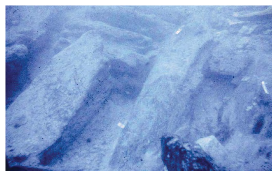
Figure 2 - Timbers revealed during the 1988 excavation

centre of the vessel (Figure 2). The vessel is of carvel construction and fastened largely with iron. The size of the site and individual elements suggest a vessel around 32m in length. Exactly how much of the ship remains buried within the seabed sediments is unknown.