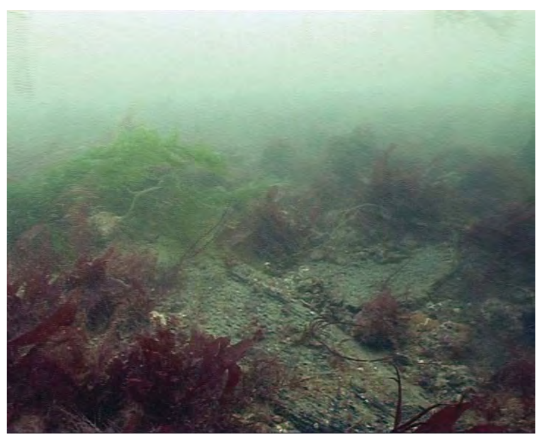
Figure 11 - Structure on seabed

Hampshire & Wight Trust for Maritime Archaeology www.hwtma.org.uk