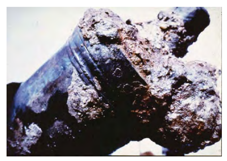
Figure 6 - Alberghetti minion

The frequency of certain types of objects within the ceramic assemblage and the relatively large number of copper scraps and pewter items are suggestive of cargo. The vessel is currently believed to be a late 16<sup>th</sup> or early 17<sup>th</sup> century merchant carrack. Although the type of trade is not clear, its cargo may have included pottery, pewter and/or scrap metal. Evidence of the cargo will be distorted by the bias of survival of certain types of artefacts and the fact extensive salvage is likely to have taken place on a vessel in shallow water close to shore. It has been suggested that the vessel may have been a Mediterranean ship engaged in some aspect of the triangular trade with England and the Low Countries (Watson & Gale, 1990).