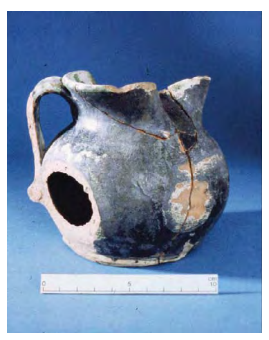
Figure 3 – Pottery jug recovered from the Yarmouth Roads wreck site

Following the 1988 excavation the total number of artefacts retrieved from the site was 256. These include ceramics in the form of Italian pottery dating from 1590 to 1620 (Figure 3); lead and pewter artefacts such as a collection of spoons; copper alloy scraps; a bronze pestle (Figure 4); stone shot; a bone comb (Figure 5) and a wooden component of a lantern.