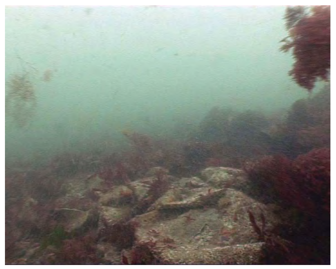
Figure 12 - Image of sandbags at the Yarmouth Roads wreck site

The majority of the structure is covered by sandbags. The sandbags are in a degraded condition (Figure 12), but have not altered considerably since they were last surveyed in 2005 (Figure 7). As such the majority of exposed material is still protected, and is therefore assumed to remain stable.