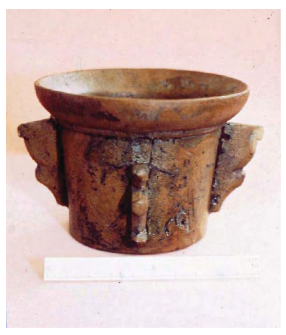
Figure 4 – Bronze pestle recovered from the Yarmouth Roads wreck site