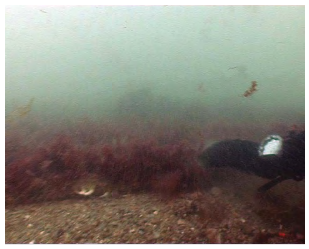
Figure 9 - Structure on seabed

The visible cultural material at the site consists of structural remains. The majority of material at the Yarmouth Roads wreck site lies in hollows in the Eocene bed rock where the archaeological material is contained within fine silts, and is either still buried or has been protected using sandbags. The diver survey carried out in 2009 recorded extant structure on the seabed, and the sandbags which cover the site.