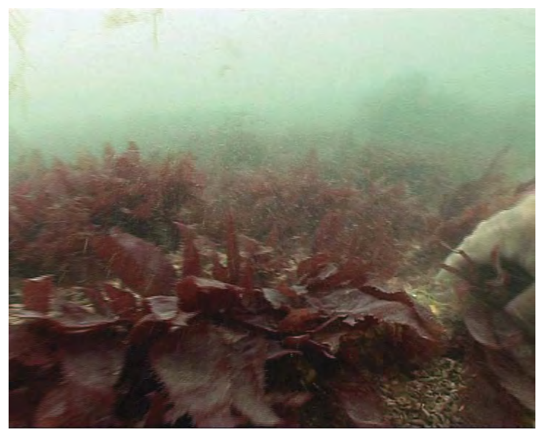
Figure 10 - Diver highlighting structure