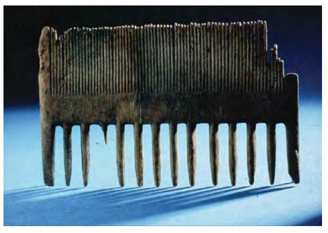
Figure 5 – Bone comb recovered from the Yarmouth Roads wreck site