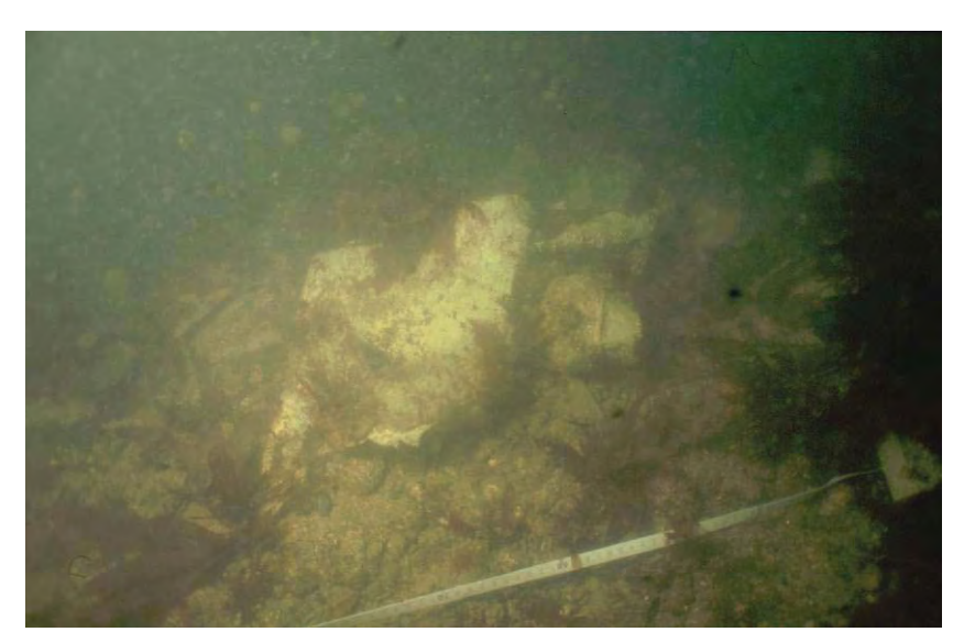
Figure 7 – 2005 image of sandbags covering the structure of the Yarmouth Roads wreck

In September 2005 a geophysical survey was undertaken of the site by Dr Justin Dix of the University of Southampton. The principle objectives for the survey were to gain data for use in monitoring the site and the surrounding area and to assess the potential for sub-surface imaging of the buried remains. The aim was to 'image' the buried hull structure to create a 3-D reconstruction. A single line of chirp seismic data was acquired over the site as poor weather conditions led to only a limited amount of data being acquired and this was of modest quality. A second geophysical survey was carried out in March 2006 using a chirp sub-bottom profiler. The results illustrated that the remains of the vessel were segmented and concentrated in the bow and stern sections, with bedrock situated in the middle of the wreck (Figure 9). The western stern section was demonstrated to be the most promising area for finding buried hull remains, remains do not appear to have survived in the amidships section. The geophysical survey suggested that the remains on the port side of the stern section were likely to extend further to the west than indicated on the original site-plan (Watson & Gale, 1990); and there appeared to be buried remains towards the bow section, mainly towards the port side (Plets et al, 2007).